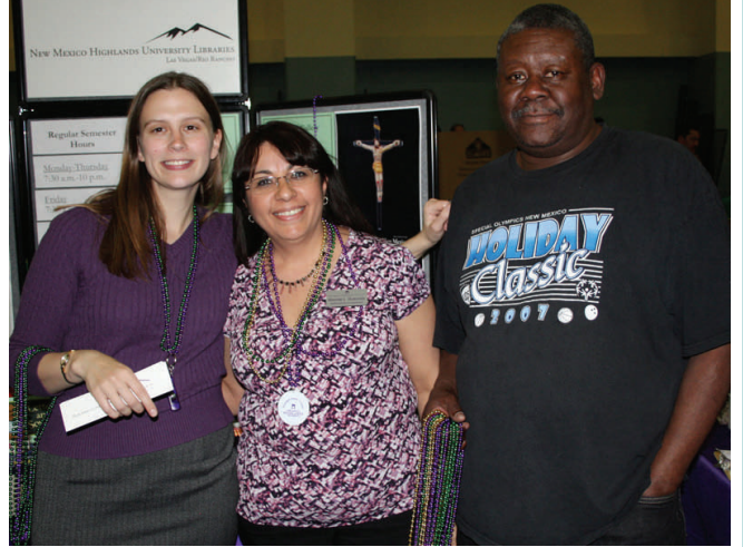
An estimated 400 students attended College Night last Monday. College Night is used to promote programs at Luna Community College and at Highlands.