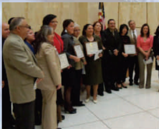
Above Left: Presentation of awards to all WLVS schools at the Roundhouse. Above Right: The Valley Elementary grades Kindergarten through 5th.