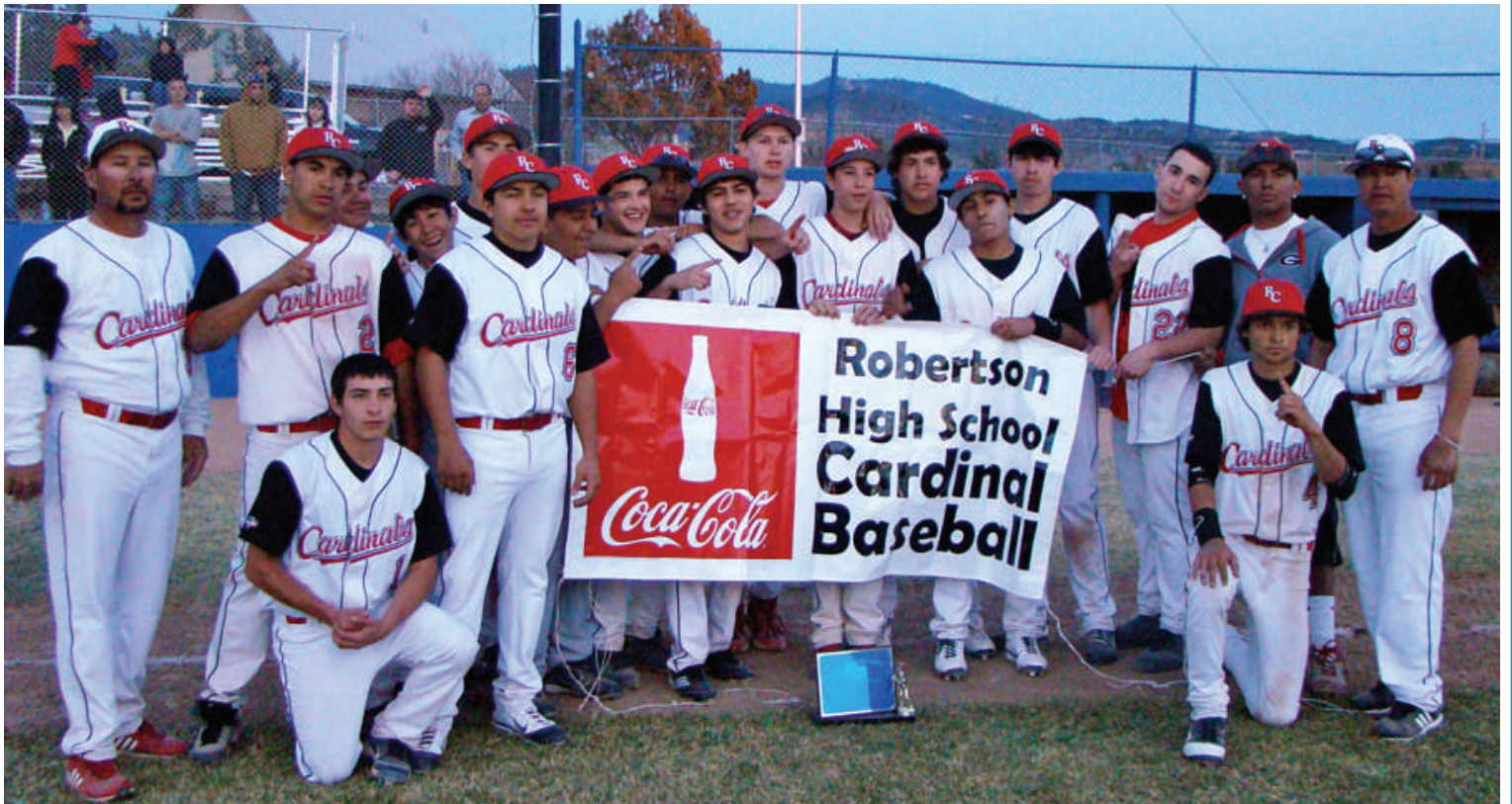
Congratulations goes out to the Robertson High baseball team that recently won the St. Mike's Tournament in Santa Fe.