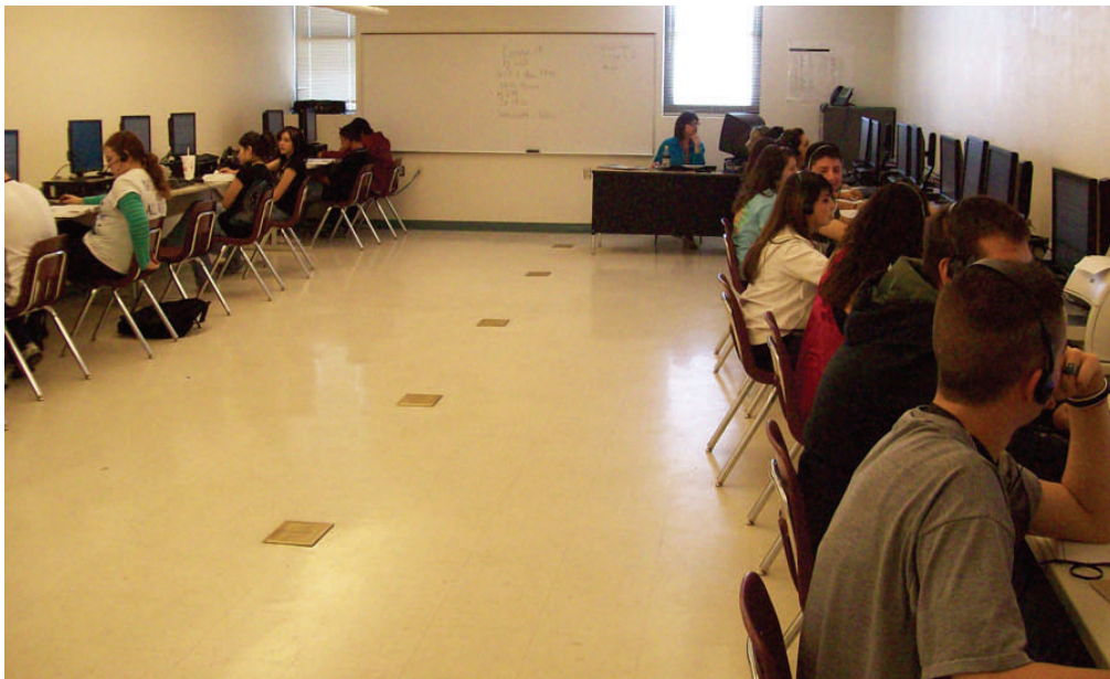
Raton High School "Healthcare Career Pathway" students are pictured here taking an online introduction to psychology dual-credit course at Raton High. This course is part of the two-year healthcare program where students have an opportunity to receive dual-credit along with preparing them for a career in the medical field. Luna Community College is providing online course delivery which consists of the pre-requisites for nursing. Students received dual-credit in BIO102 medical terminology during the 2010 fall and are presently taking PSYC101 introduction to psychology. Miners Colfax Medical Center is providing the clinical aspect of the two-year program where students received hands on experience which allows them to work side-by-side with a mentoring healthcare team.