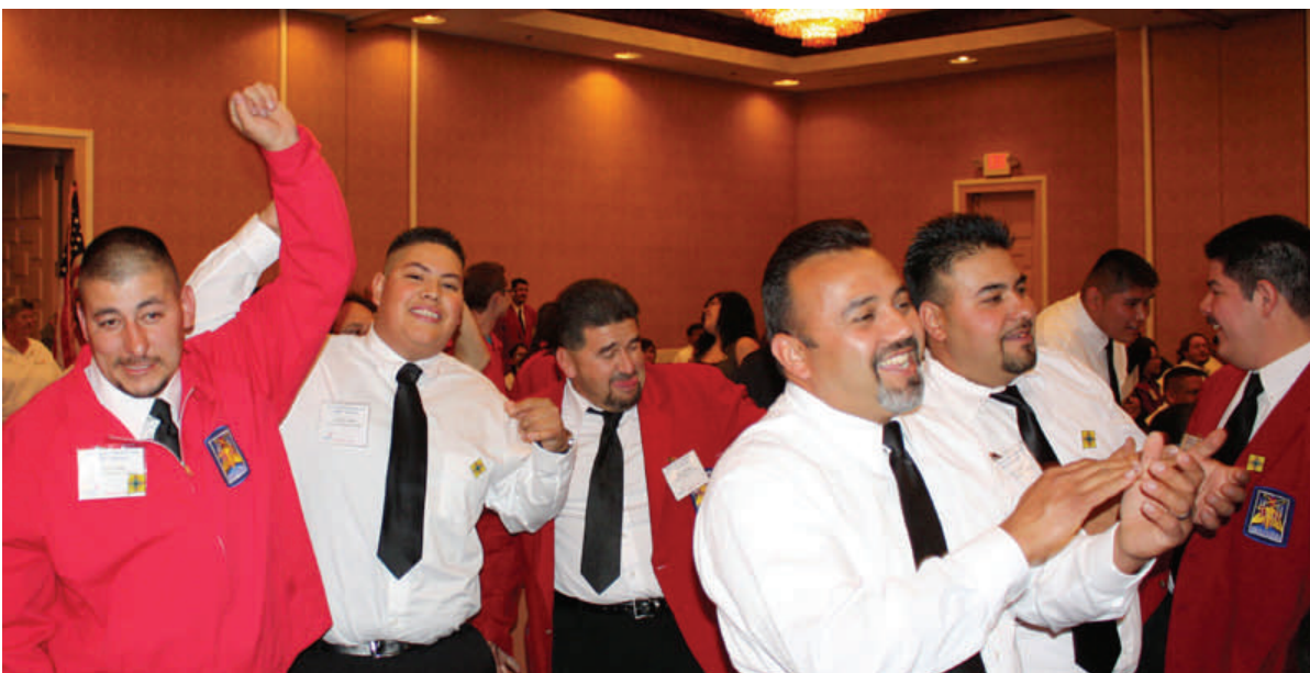
LCC students and staff get into the groove at the opening ceremony.