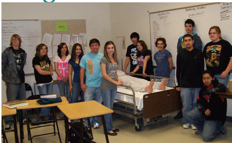
Students from high school healthcare career pathways.

Providing a diverse approach which includes on-line pre-requisites for nursing, vocational courses consisting of basic residential wiring, welding cabinet making, mass media and other courses to enrich the educational delivery in the area has proven to help students prepare for the changing work environment or planning which a four-year institution will best serve their educational and