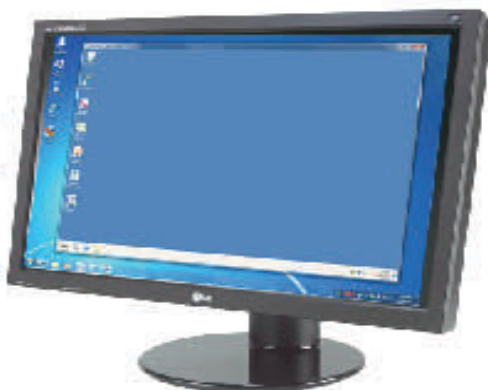
Shown above is an actual image of a computer connected to the LCC Remote Desktop server.