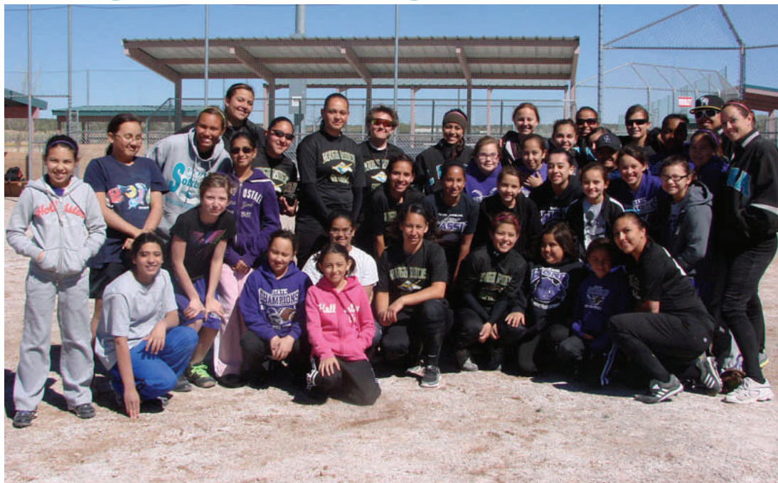
Luna Community College softball players and Santa Rosa Little Leaguers.

Luna is looking to host camps in Las Vegas and other surrounding areas.