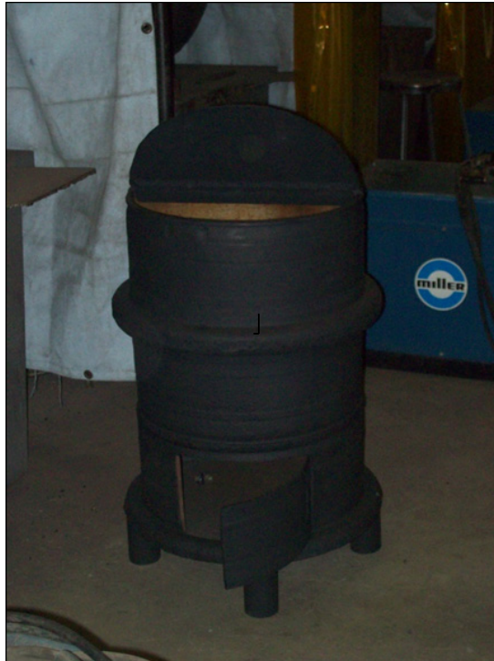
Student Neftali Roybal made a fireplace out of rims.