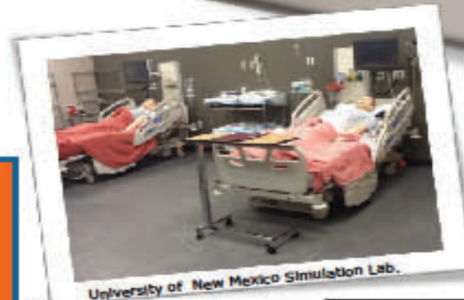
University of New Mexico Simulation Lab.