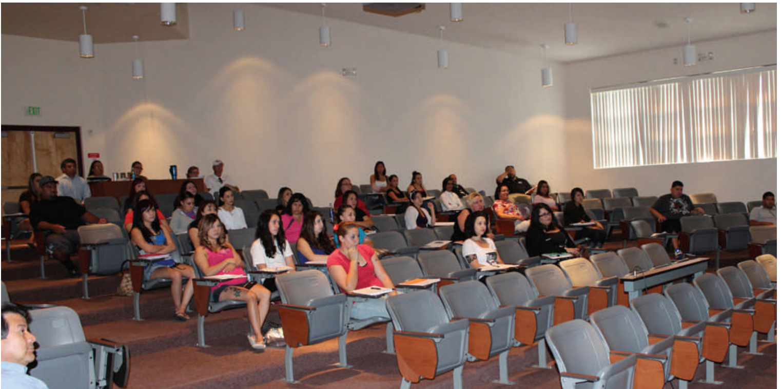
Luna Community College first-year LPN students attended orientation on Friday, Aug. 3. Students heard several presentations ranging from ACCESS Center to financial aid.

Luna Community College makes every attempt to make financial aid available to all eligible students in order to assist them in pursuing their educational goals. Students please keep in mind that there is a procedure that needs to be followed when awarding financial aid and the LCC Financial Assistance staff is here to guide you along the way. However, as in all areas of life, there are guidelines that govern the ability of the college to provide assistance to a student.