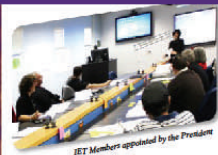
IET Members appointed by the President