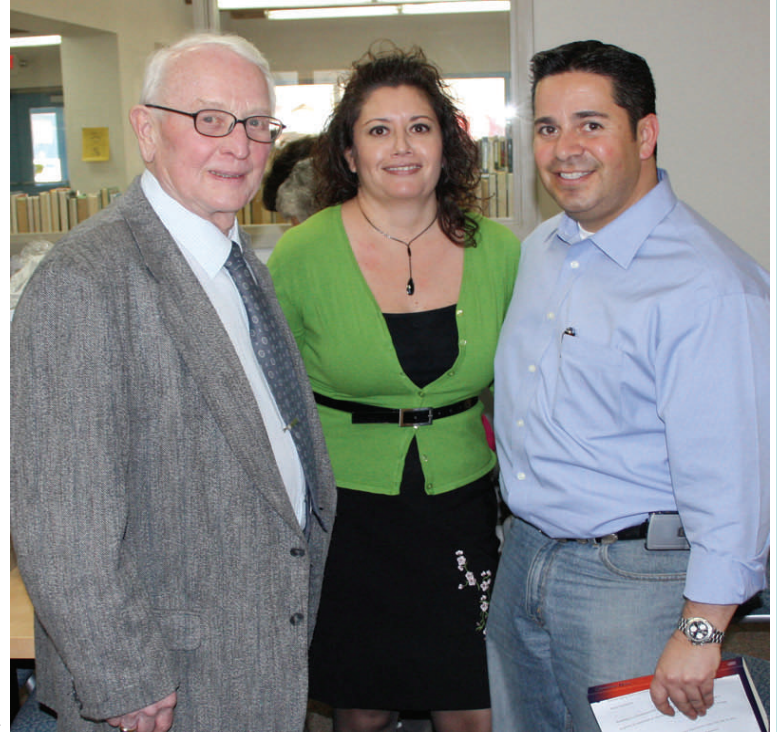
Because of the generosity of Gov. David F. Cargo and Congressman Ben Ray Lujan, as well as numerous donations from the community, the library has vast book collection.

Gov. Cargo will surely be missed, but never forgotten and he would certainly be proud of how many students, both young and old, who have greatly benefited from his contributions and his blessing of combining the library and LCC.