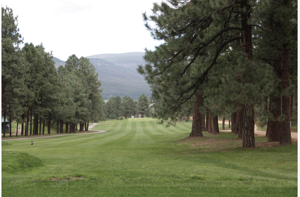
This picture was taken of the first tee at Pendaries during last year's LCC Foundation Golf Tournament.

Prizes will be given for longest drive (men & women's division) and closest to the pin