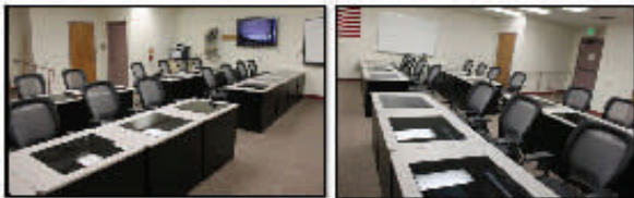
Finalized Santa Rosa Smart Lab

The last of the Title V labs have come to a close in which the Santa Rosa site has been preparing for its students who are taking online courses. Sixteen (16) workstations and PC’s along with a Smartboard, printer/scanner and a security camera have been delivered and are currently getting installed at the designated lab.