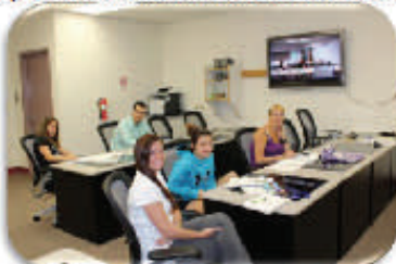
Students fill the Santa Rosa Smart Lab for their classes