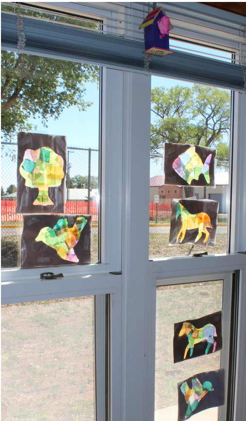
LCC Preschool students show hard work pays off. Top: Class showcases ladybugs made by preschool children; students on a lady bug hunt; birds and houses made by students; sea turtles making their way out to the ocean and stained glass art.