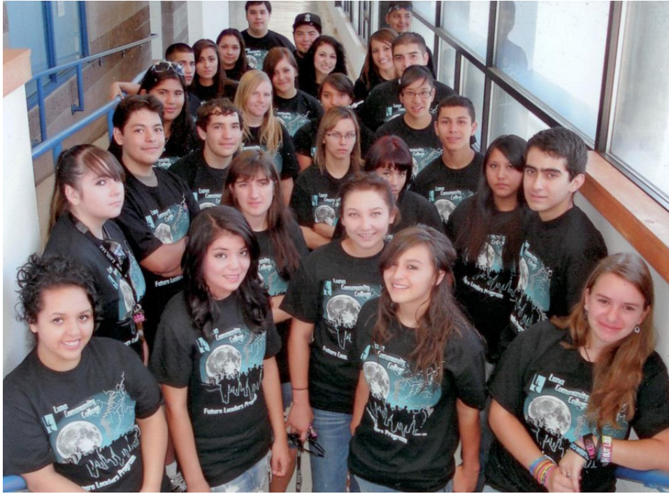
Future Leaders Program students take time to take a group photo last year. LCC has been offering summer programs for youth for nearly one quarter of a century.

Luna Community College is offering two enhanced college credit summer programs for upcoming high school juniors and seniors along with 2012 graduating seniors. The first is a Student Academic Advancement Institute (SAAI) which is available to high school students who will be classified as a junior or senior next school year. The second is a Future Leaders Program (formerly known as the Tech Prep Summer Program) which is available to high school students who will be classified as a junior or senior next school year and also for students who will be 2012 graduating seniors. This program will be offered under the Department of Science, Math & Engineering Technology.