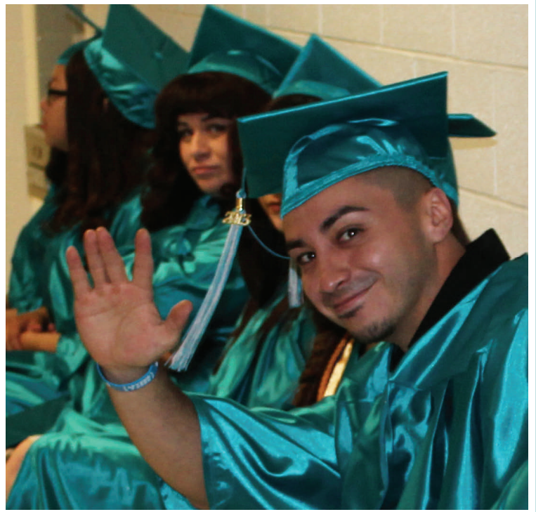
Luna Community College