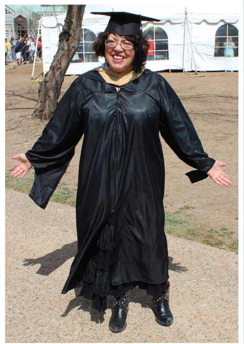
LCC: "The People's College"