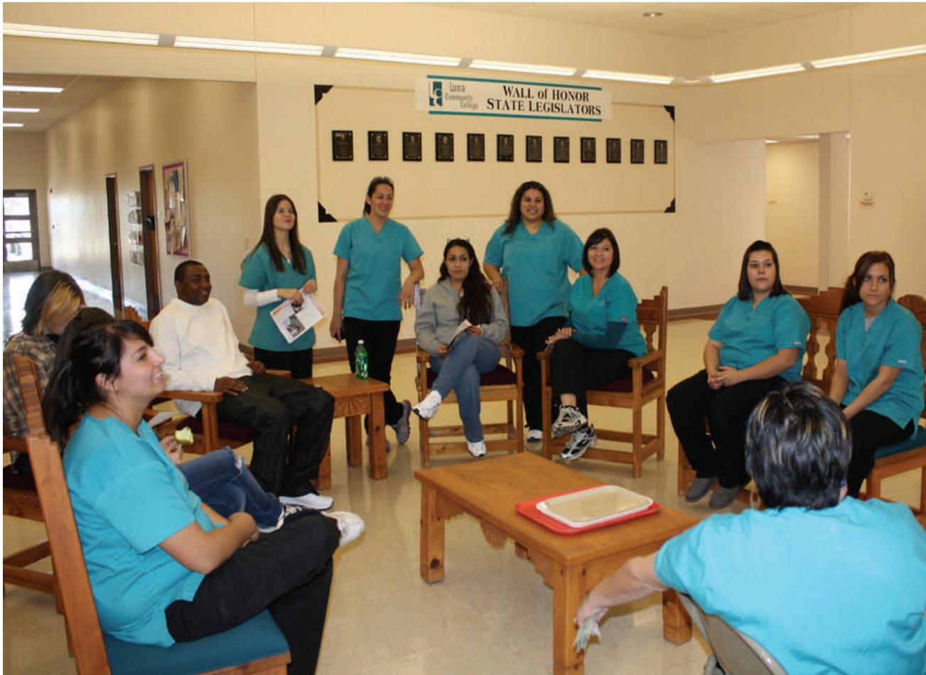
These Luna Community College students were part of the 17 that auditioned to be in a commercial for the college. The auditions were held by the LCC Mass Media Department. The commercial is expected to be ready by the end of the semester.

So, to each of you – our students at Luna Community College – work hard, don't be bashful - ask for help, study, develop your skills, don't give up and always remember, when you give life your best many good things will come your way. Your life's journey is very important to us.