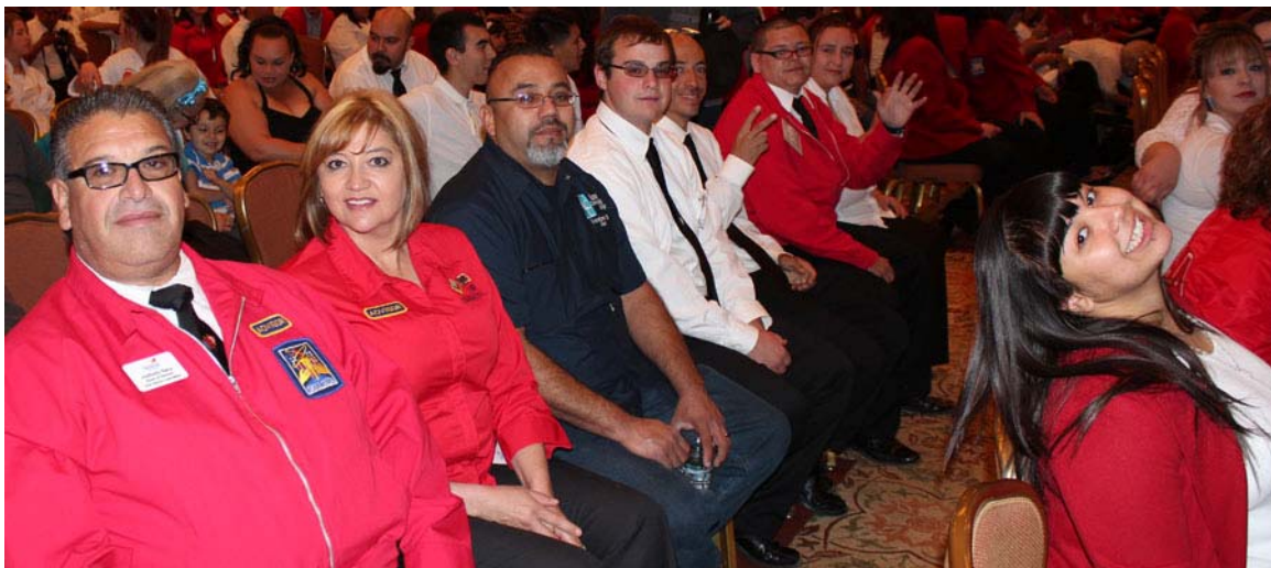
LCC students and staff take a moment for the camera before the closing ceremony Saturday morning in Albuquerque.