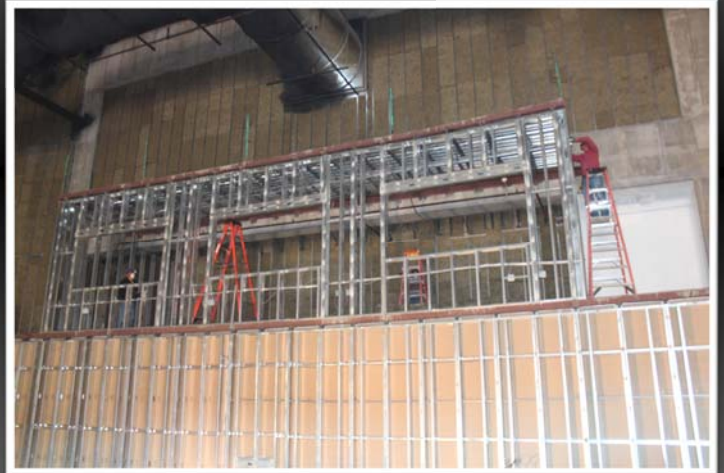
Painting, electrical, mechanical and framing crews have started working on the Media Education Center. Auditorium seating is scheduled to be on-site the first week of April.