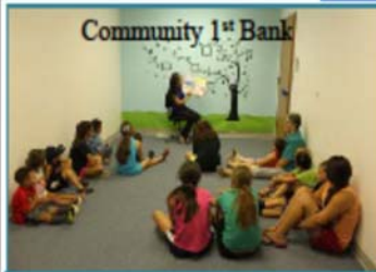
Come join us at Luna Community College in Santa Rosa July 24 & 31 At 1:00 P.M.