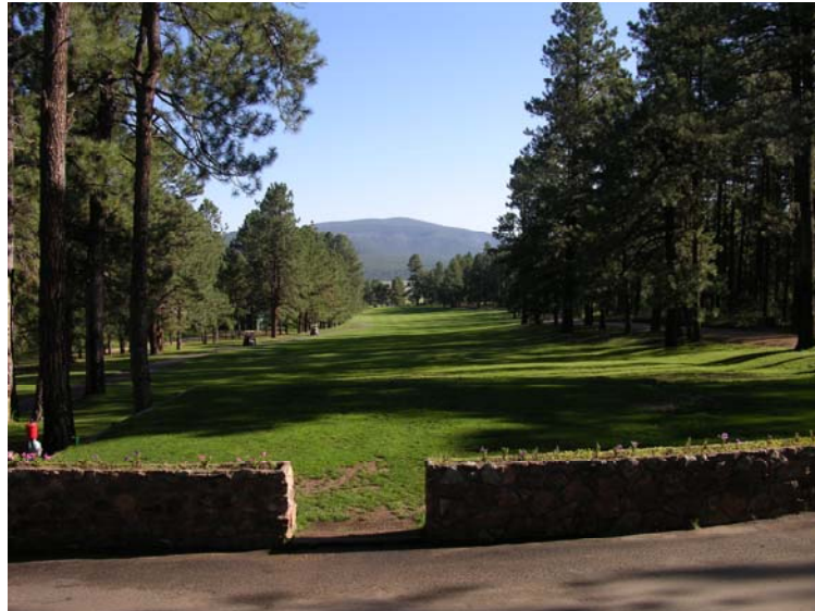
This photo depicts the beauty of Pendaries Golf Course in Rociada.

A four-person team sponsor is $1,000 or $250 per individual. Individuals are welcomed to play. A hole sponsorship is $250. The entry fee covers green fees, a cart, and a prime rib dinner. All money raised will be used to match a Title V endowment for academic scholarships.