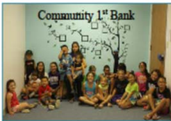
18 kids showed up for the first session. Thank you to Community 1st Bank for having Story Time & Snacks.