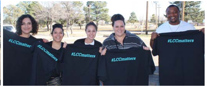
Luna students and employees displayed unity over the last seven months reminding stakeholders that Luna does matter. The College started using the tagline #LCCmatters in December.