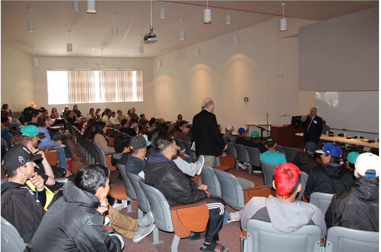
Higher Learning Commission Peer Reviewers held both a Student and Public Forum at the Nursing Auditorium on Monday, March 19 and Tuesday, March 20, respectively. Over 100 students attended their forum and nearly 200 people attended the Community Forum.