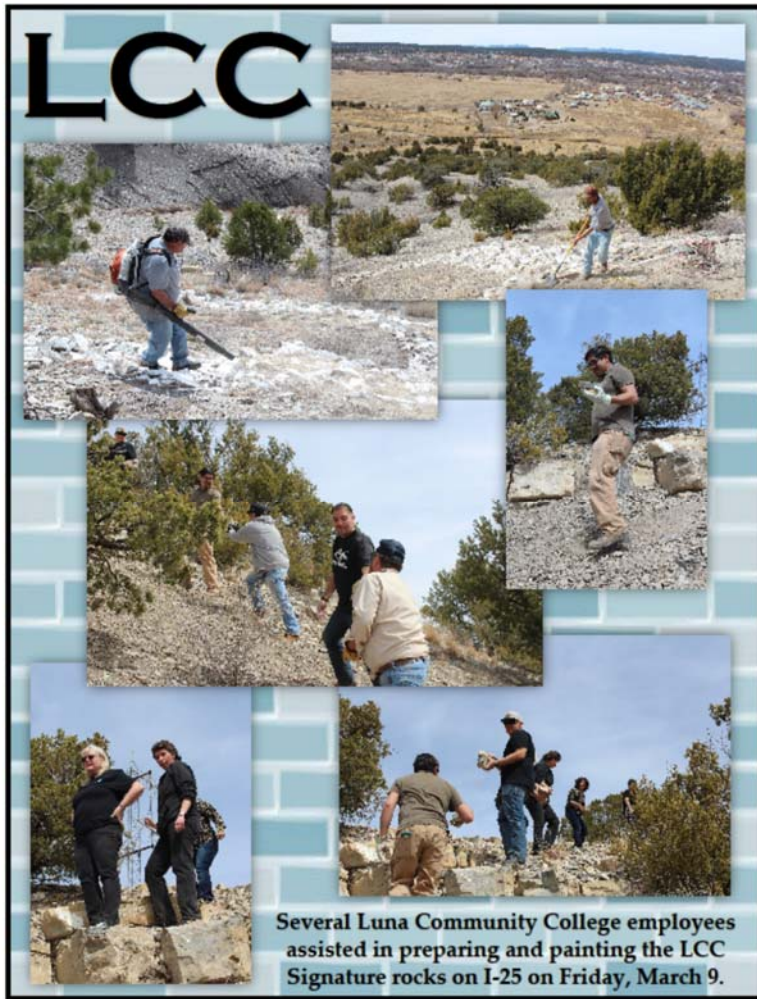
Several Luna Community College employees assisted in preparing and painting the LCC Signature rocks on I-25 on Friday, March 9.