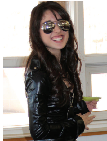
LCC: "The People's College"