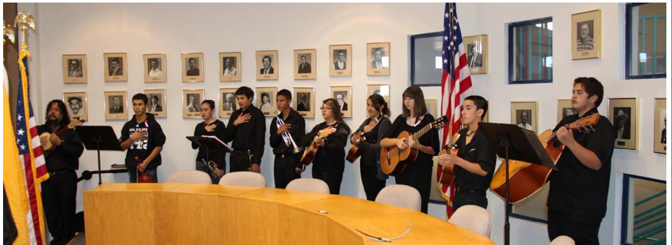
The West Las Vegas student mariachi band played the national anthem prior to the ceremony.