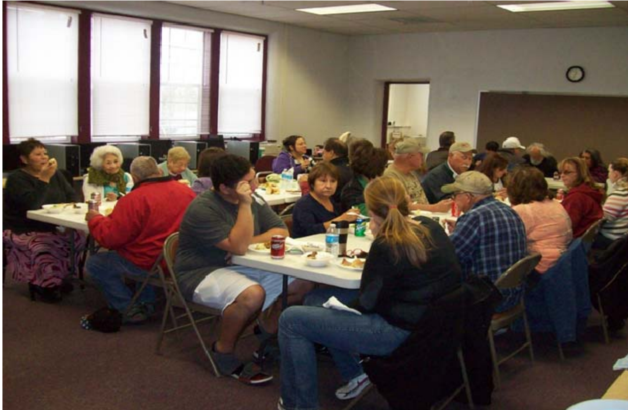
Students and staff enjoying their delicious meal.