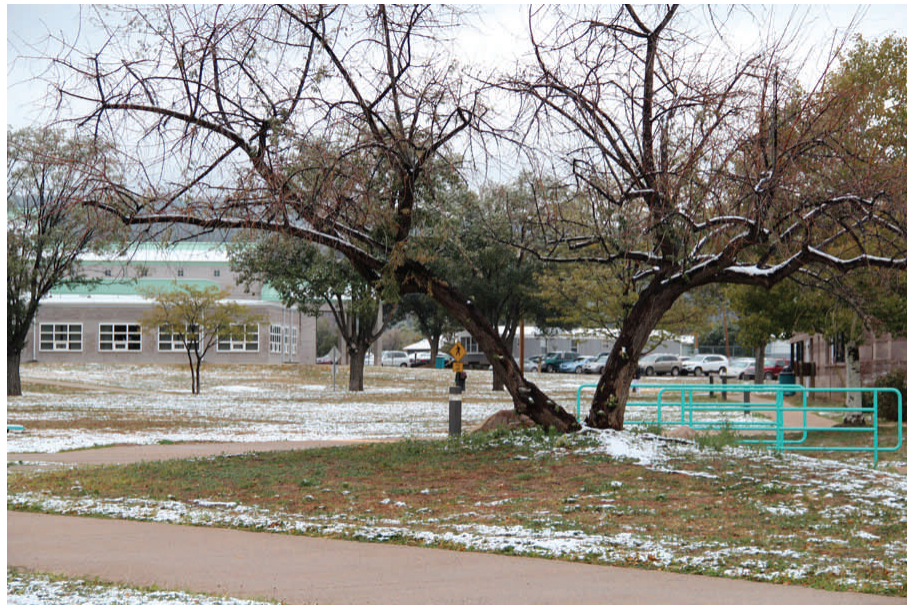
Luna Community College students and staff woke up to a combination of fall and winter on Wednesday, Oct. 16. The campus received about one-eighth of an inch of snow on this day.