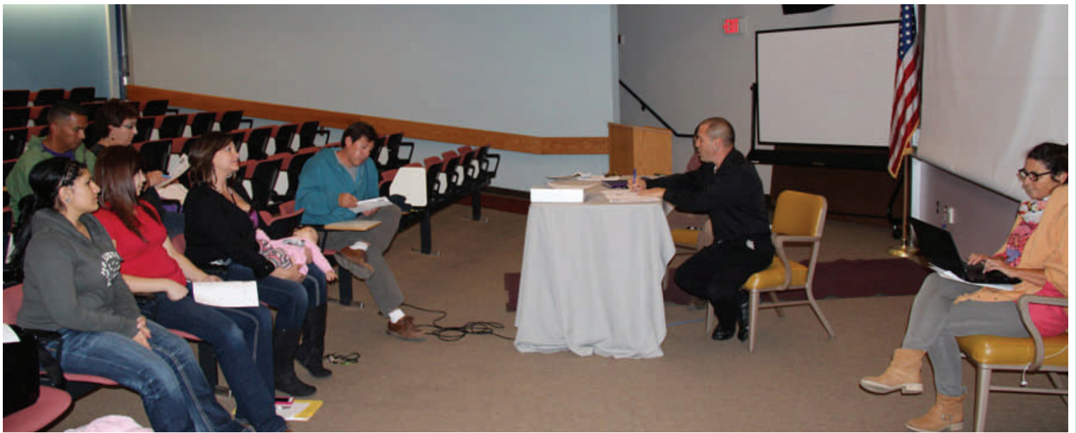
Luna Community College Student Government held their regular meeting last Friday. Students are encouraged to attend the meetings and provide input.