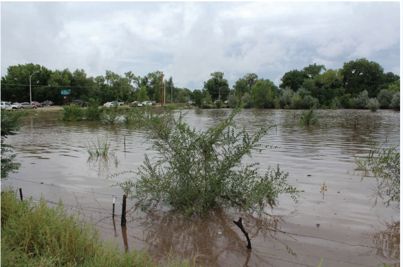
This photo of the Gallinas River on Mills Ave. was taken at 9:30 a.m. on Friday, Sept. 13. Several rain showers and storms hit New Mexico in the latter part of last week.

Absentee voting for the 2013 Luna Community College Student Government Elections will be held from 8 a.m. to 5 p.m. on Wednesday, Sept. 18 and Thursday, Sept. 19 at the Admissions Department in the Student Services Building. A Luna Community College ID is required. Regular voting will be held from 1 p.m. to 4 p.m. on Friday, Sept. 20 at the Rough Rider Grill.