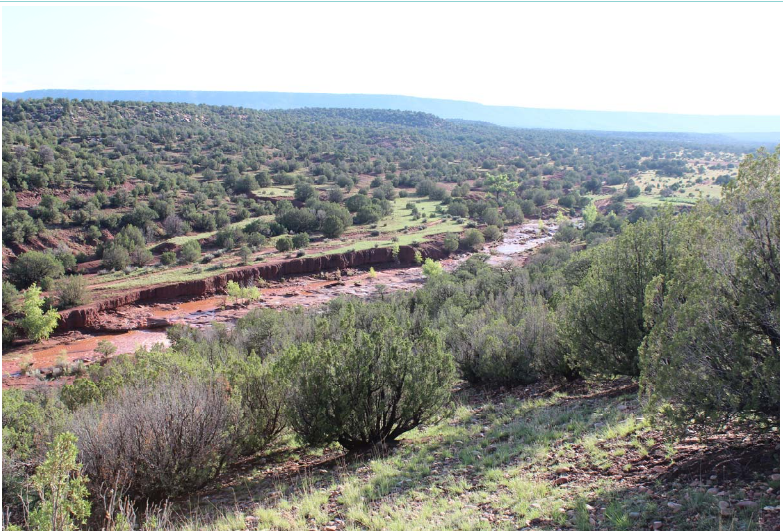
Northern New Mexico got its share of rain this summer. This particular picture depicts an arroyo running in El Pueblo (30 miles south of Las Vegas). Any Luna Community College student or employee wishing to have a nature photo published in The Luna Light , can send it to jgallegos@luna.edu .