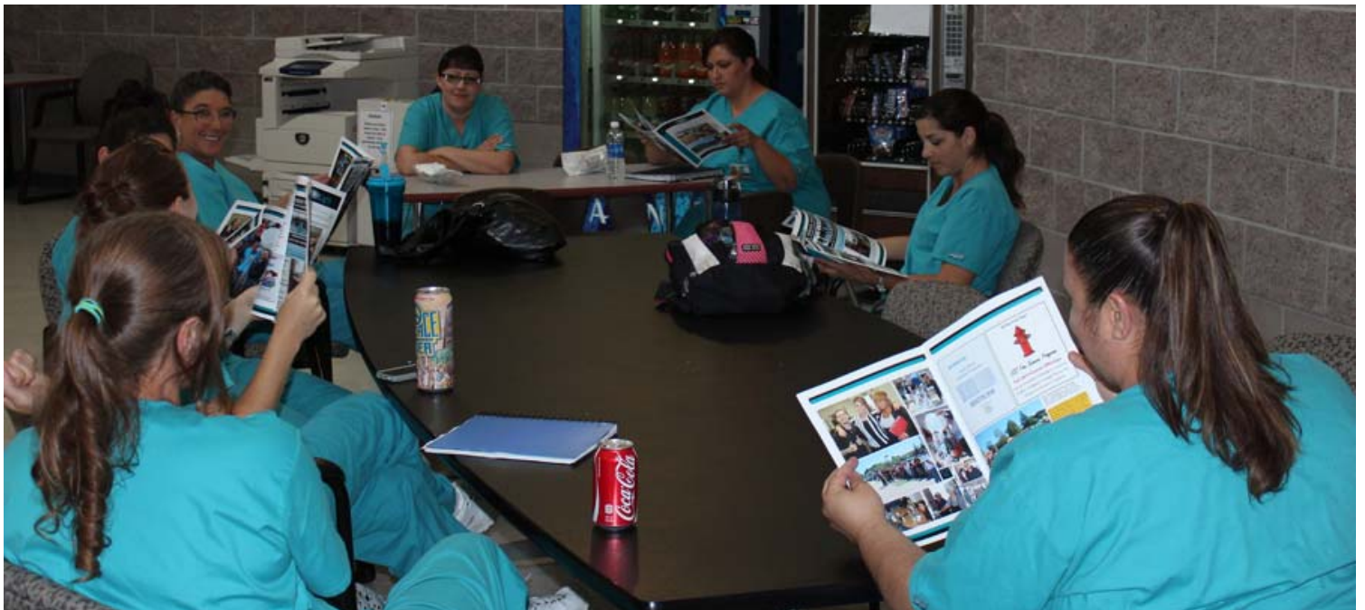
Luna Community College nursing students take a break recently and read The Luna Light . For more information on the LCC Nursing Program, please call 505/454-2523.