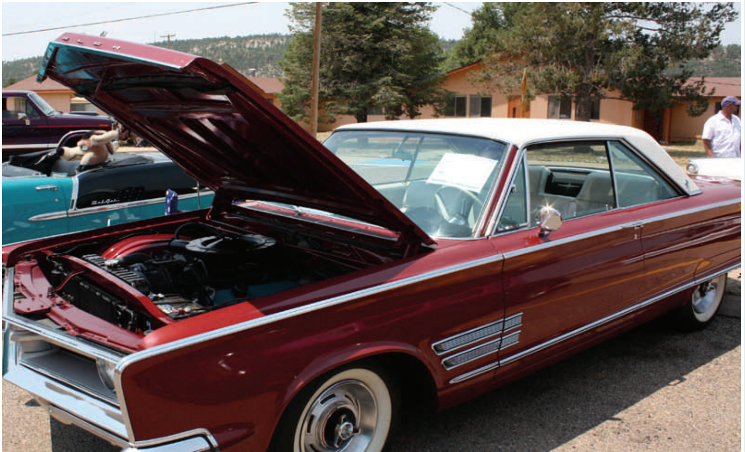
The 9 th Annual LCC Car Show expects to feature 100 entries this year.