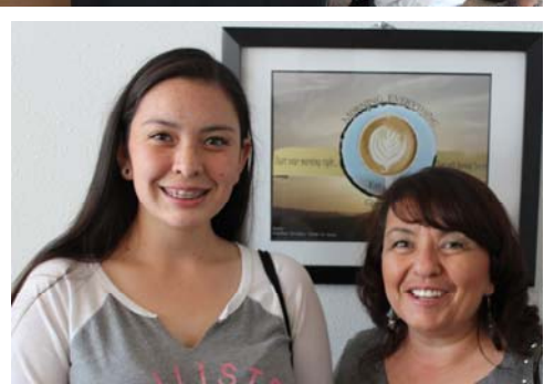
"Creating Opportunities for You!"