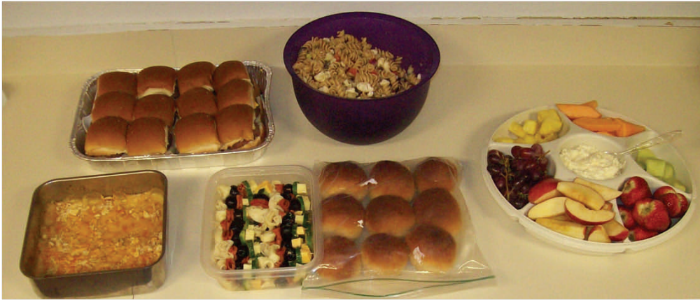
The photo shows all the dishes made by the LCC Satellite Recipe Club.