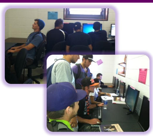
Luna's Rough Rider baseball team testing online admissions applications.

On Saturday, August 24, 2013, the Rough Rider Baseball team were invited to the Title V labs to test out the new online admissions application through Pathways.