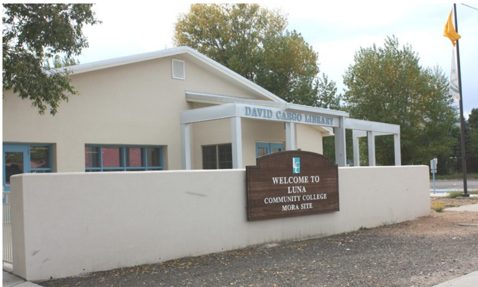
The Luna Community College-Mora Site is located in the heart of Mora. A recent visit by LCC employees was well-received by Mora High students.