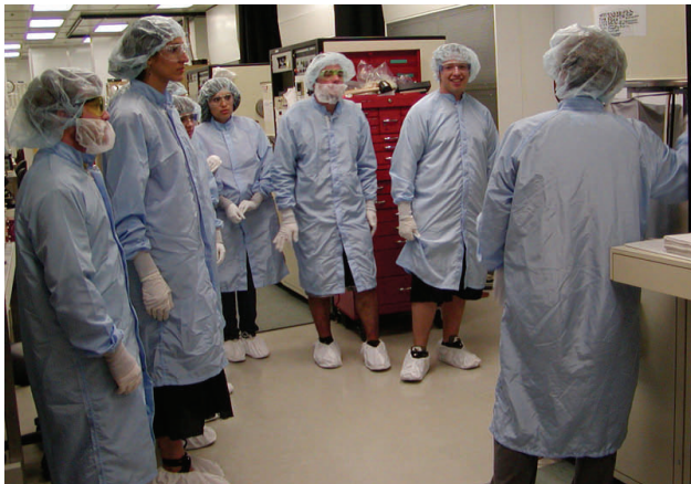
LCC Tech Prep Summer Program students tour Sandia National Laboratories in Albuquerque. The Tech Prep Summer Program is designed to provide educational enhancement in the fields of math, science and technology.