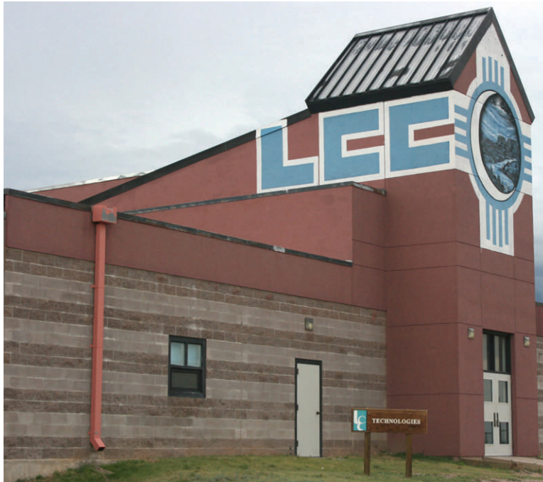
Pictured above is LCC Technologies Building. For more information on the SMET Department, call 505/454-5370.

The BCS program hires tutors and student instructional leaders (S.I.L.) that help students with traditionally difficult classes such as physics and calculus. Students who wish to become a tutor or S.I.L. get paid for their efforts and become better students in the process. The BCS program also provides money for exceptional students to work as an intern with various agencies. The department is dedicated to providing a