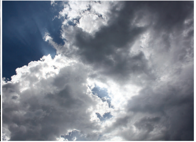
These two photos taken minutes from each at around 4:30 p.m. last Wednesday. The left photo was taken near the LCC Student Service Building. The other photo was taken near the LCC Bookstore. About one hour later, rain fell in the Las Vegas area.