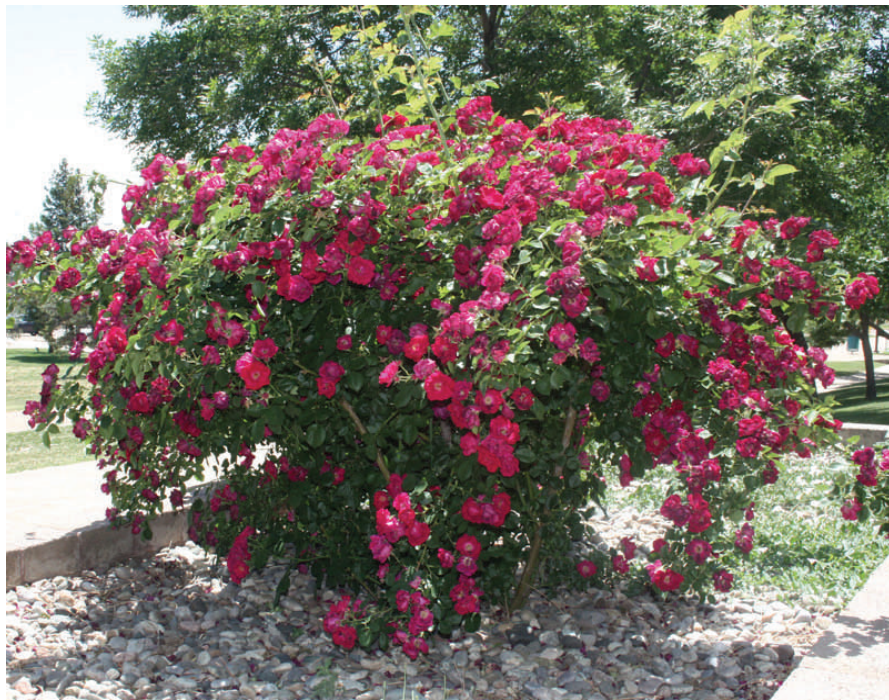
This rose bush, one of five around campus, is an indication of the up-keep of the college. Many visitors have complimented the LCC family for its appearance.

■ 11:00 a.m. – 1:00 p.m. Independence Day at LCC “Student Activity” (IPC/Café)