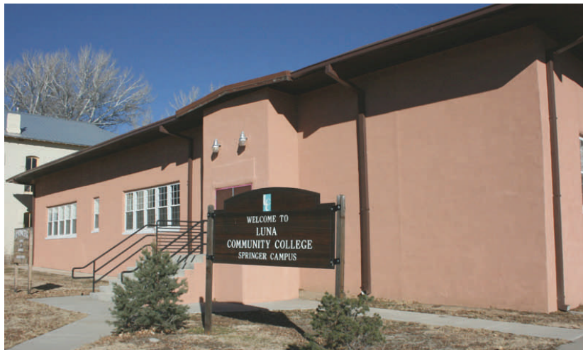
The next LCC Board of Trustees meeting will be held 6 p.m. on Wednesday, July 21 at the LCC Springer Satellite.