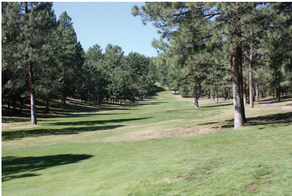
This photo shows the beauty of Pendaries Golf Course.

All funds raised will be matched dollar-for-dollar by a U.S. Department of Education