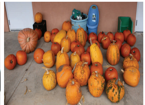
Cosmetology students got into the Halloween spirit last week when they dressed up for their annual bash. In the bottom photo, several pumpkins were donated to the Luna Community College Day Care by parents and LCC employees. The kids participated in a pumpkin patch and decorated their pumpkins with their parents on Family Night.