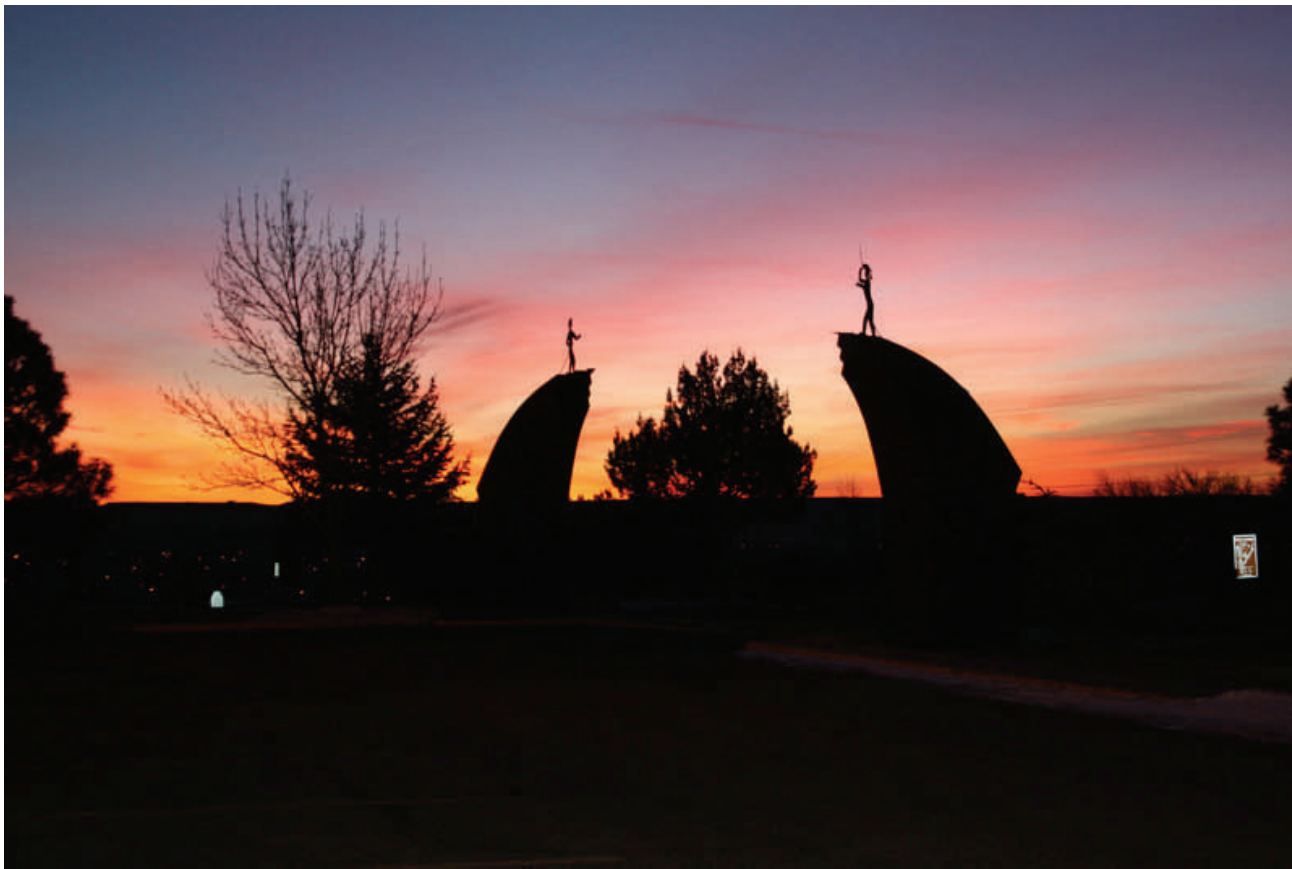
Here is a photo of the sunrise that was taken at about 6:45 a.m. on Monday, Jan. 11 at the south entrance at Luna Community College.