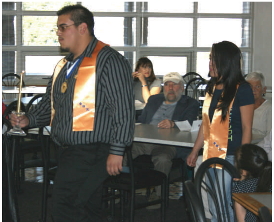
Here is a file photo of a Phi Theta Kappa Induction Ceremony. LCC’s Beta Mu Nu Chapter is highly regarded internationally.