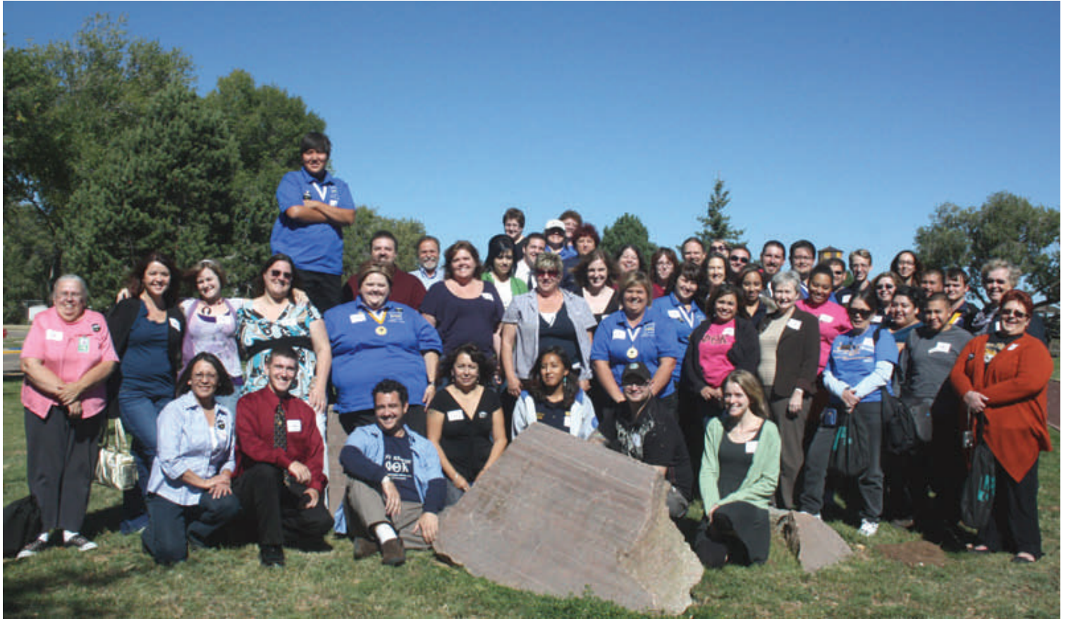
Luna Community College hosted the Phi Theta Kappa New Mexico Region Conference this past weekend. Students from 10 New Mexico Community Colleges attended the conference.