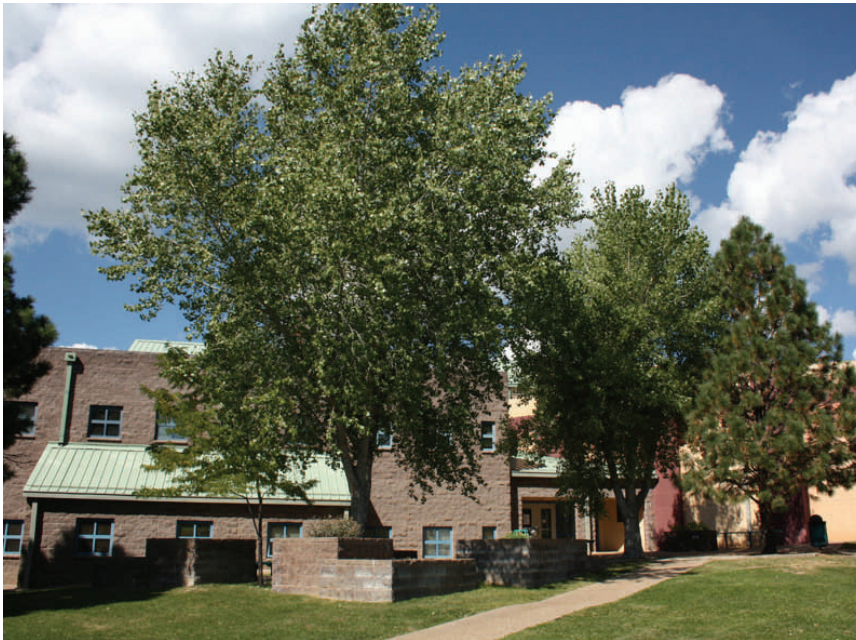
This area outside the LCC Student Service Building is one of two spots where filming will take place.

Luna Community College will be one of several colleges from across the state that will take part in an image video that will be used to help build understanding and support for the community college mission in New Mexico.