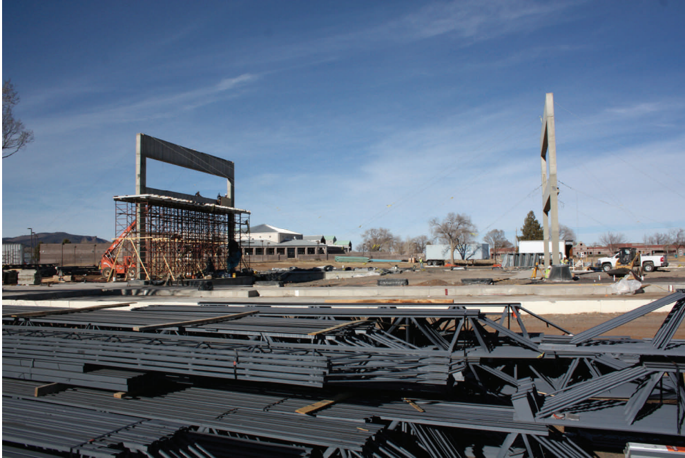
Here is a photo of the progress of LCC's Education Media Center. The photo of was taken on Thursday afternoon.