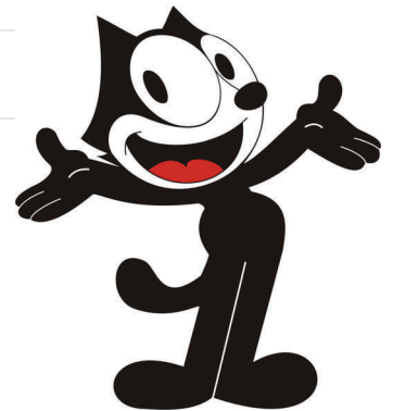
Felix The Cat