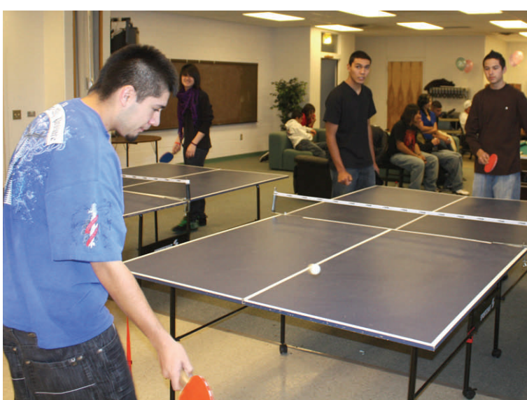
Luna Community College students enjoy the newly-opened game room that is being run by the LCC Student Government. The game room is open from 9 a.m. to 3 p.m. Monday-Friday.