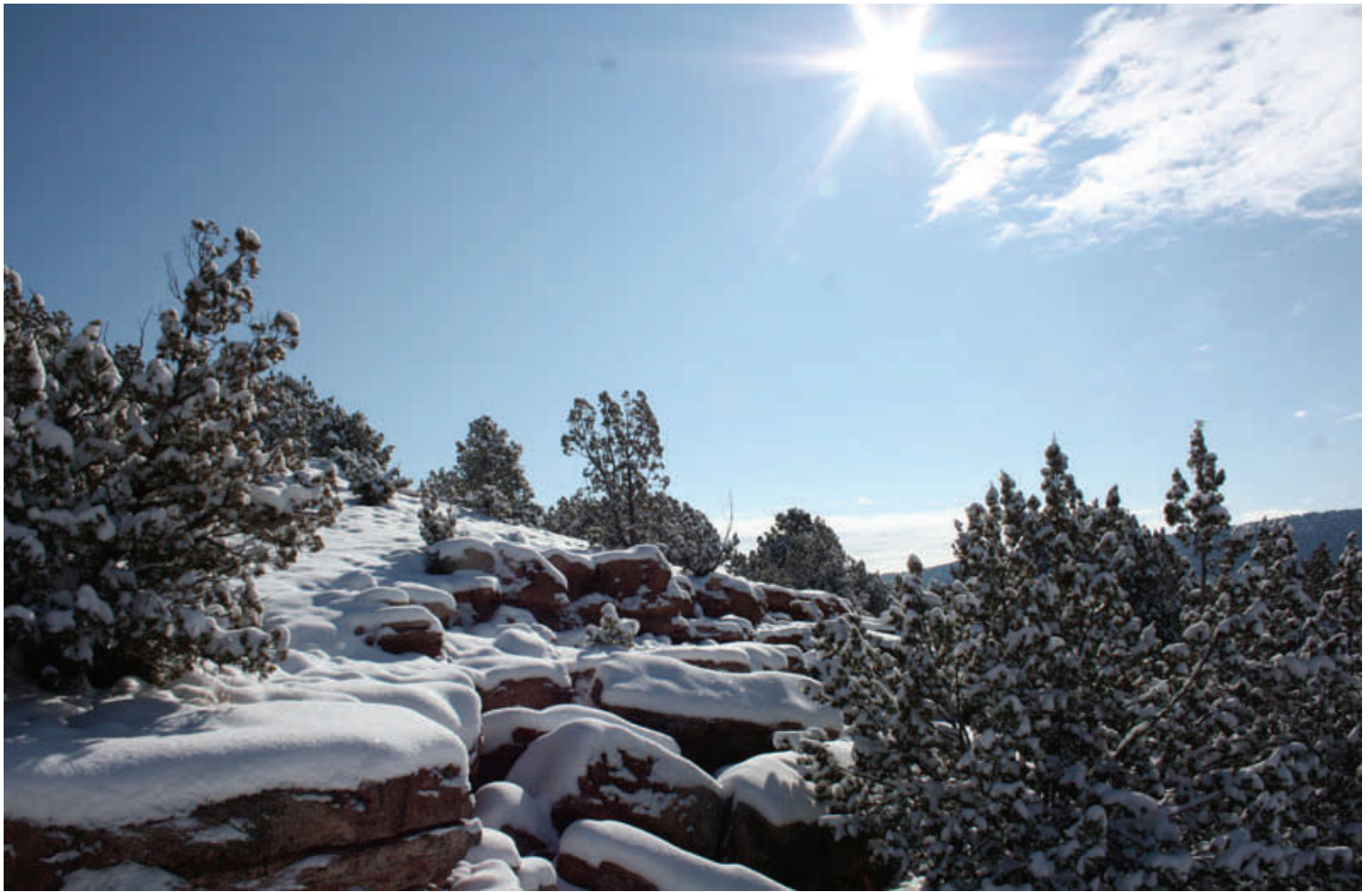
Several inches of snow fell in the northern part of the state on Thursday. This picture, taken in El Barranco, a small village about 30 miles south of Las Vegas, shows the sun breaking through on Friday morning.