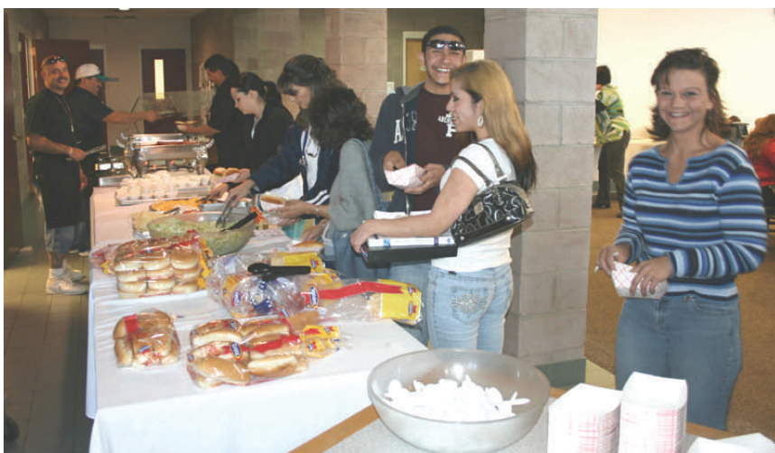
LCC sponsored barbeques such as this one enhances student life at the college.

Of course, losses due to student attrition aren’t just realized on the institutional side. Students lose too. Students who drop out of the educational pipeline lose their initial fiscal investment and those who leave before completion of the program are more likely