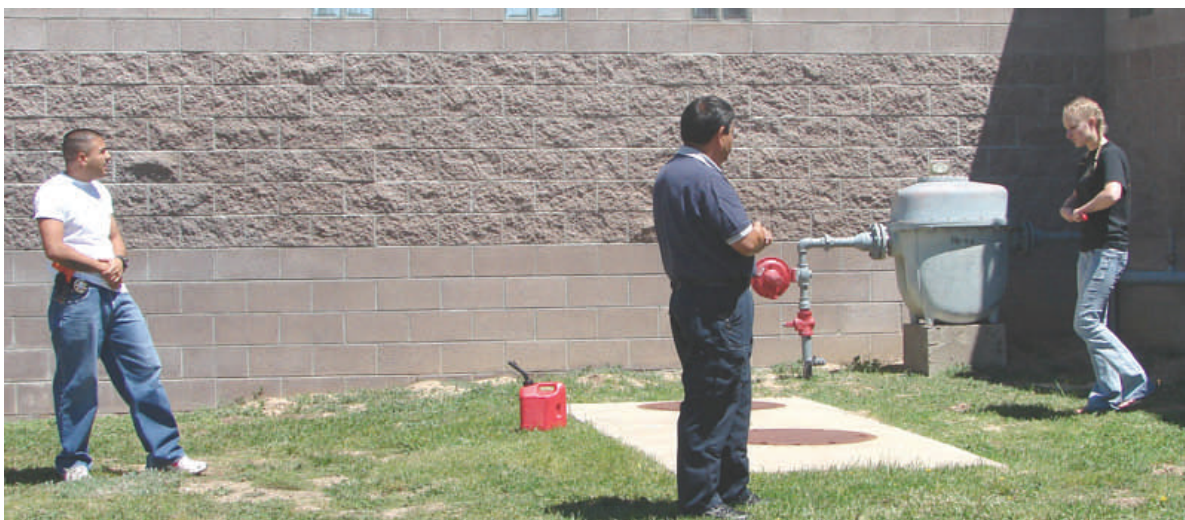
Two officers that attended a crisis intervention training at Luna Community College go through a simulation exercise. This particular role playing displays an individual that intends to start a fire.