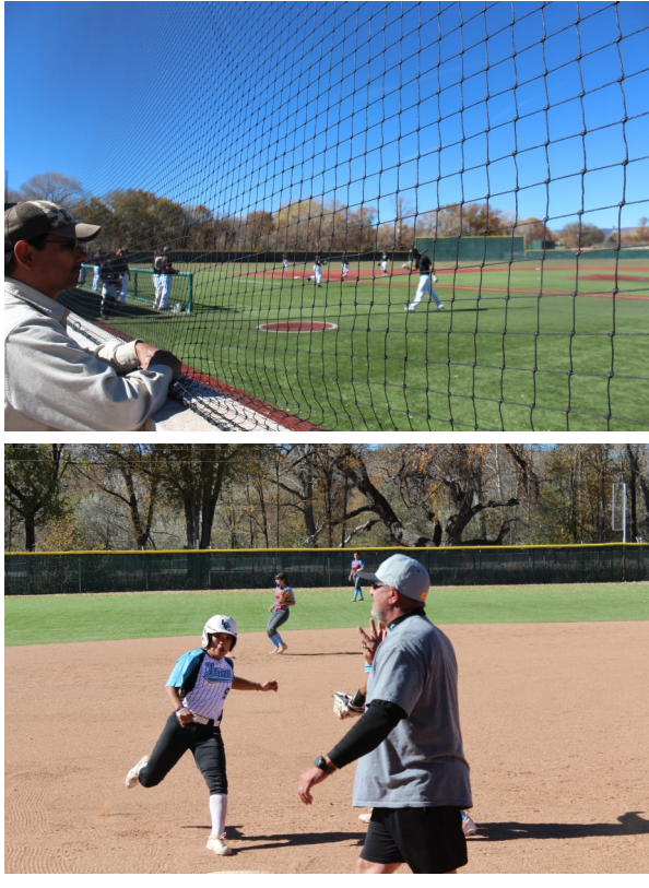
Luna student-athletes, coaches, employees and community enjoyed Appreciation Day on Sunday, Nov. 6.