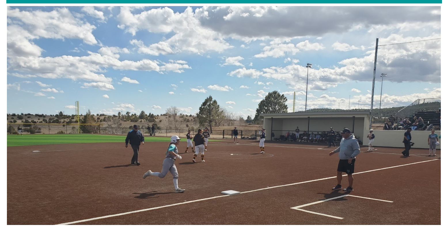
The Luna Community College softball team split two games with Trinidad Junior College recently at Rodriguez Park. The Lady Rough Riders are scheduled to play at Northeastern Junior College Friday and Saturday. The Luna baseball team is scheduled to play Lamar Community College at home on March 28.