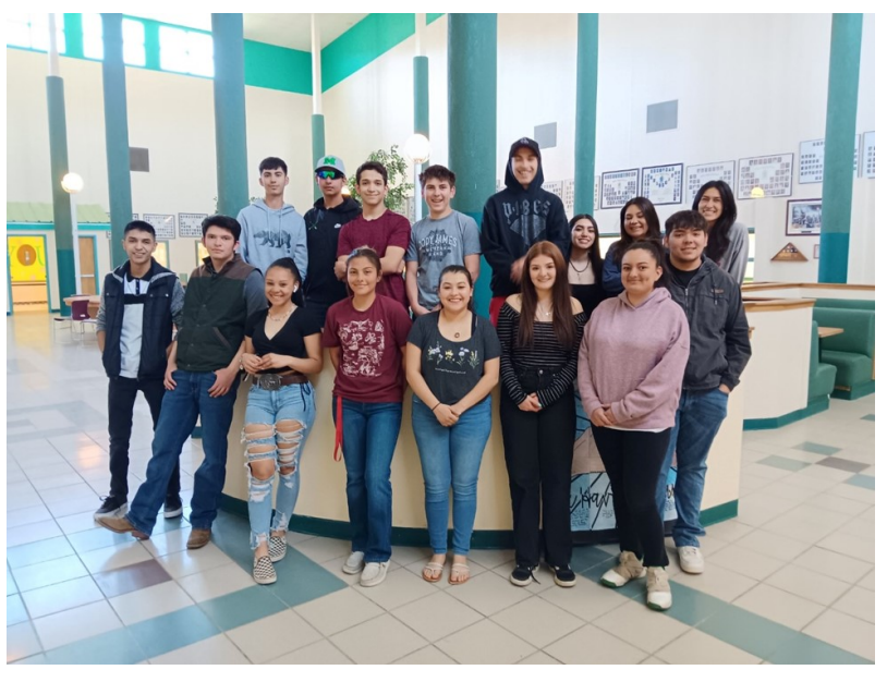
Twenty one dual credit high school students in Mora received $100 stipends in April to help with the direct impact they faced due to the Hermit's Peak/Calf Canyon wildfires.

www.lunafoundationnm.org. Our new website hosts quick and easy donation links for our various funds and projects along with information on upcoming fundraisers, current board member information, and more.