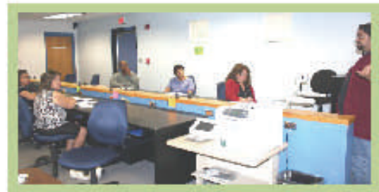
Blackboard & WIMBA Faculty Trainings