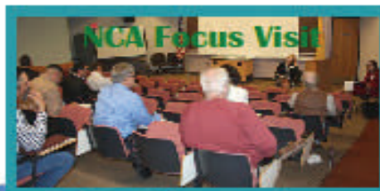
NCA Focus Visit