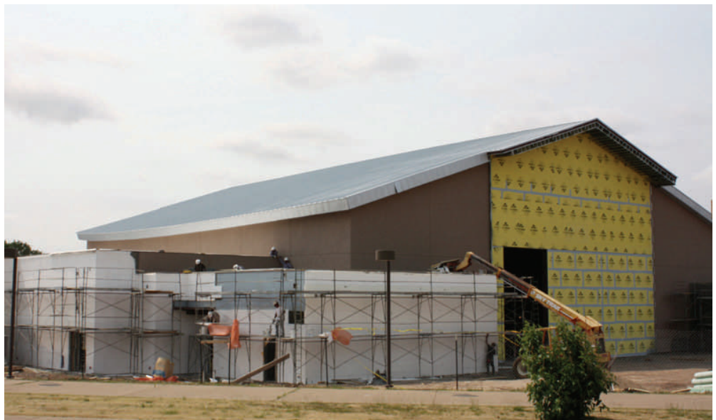
The Luna Community College Media Education Center is approximately 75 percent complete with a push to complete it by October. This will be a big addition to Luna Community College to serve the needs of our students.