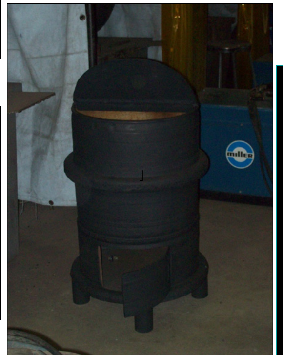
Student Neftali Roybal made a fireplace out of rims.