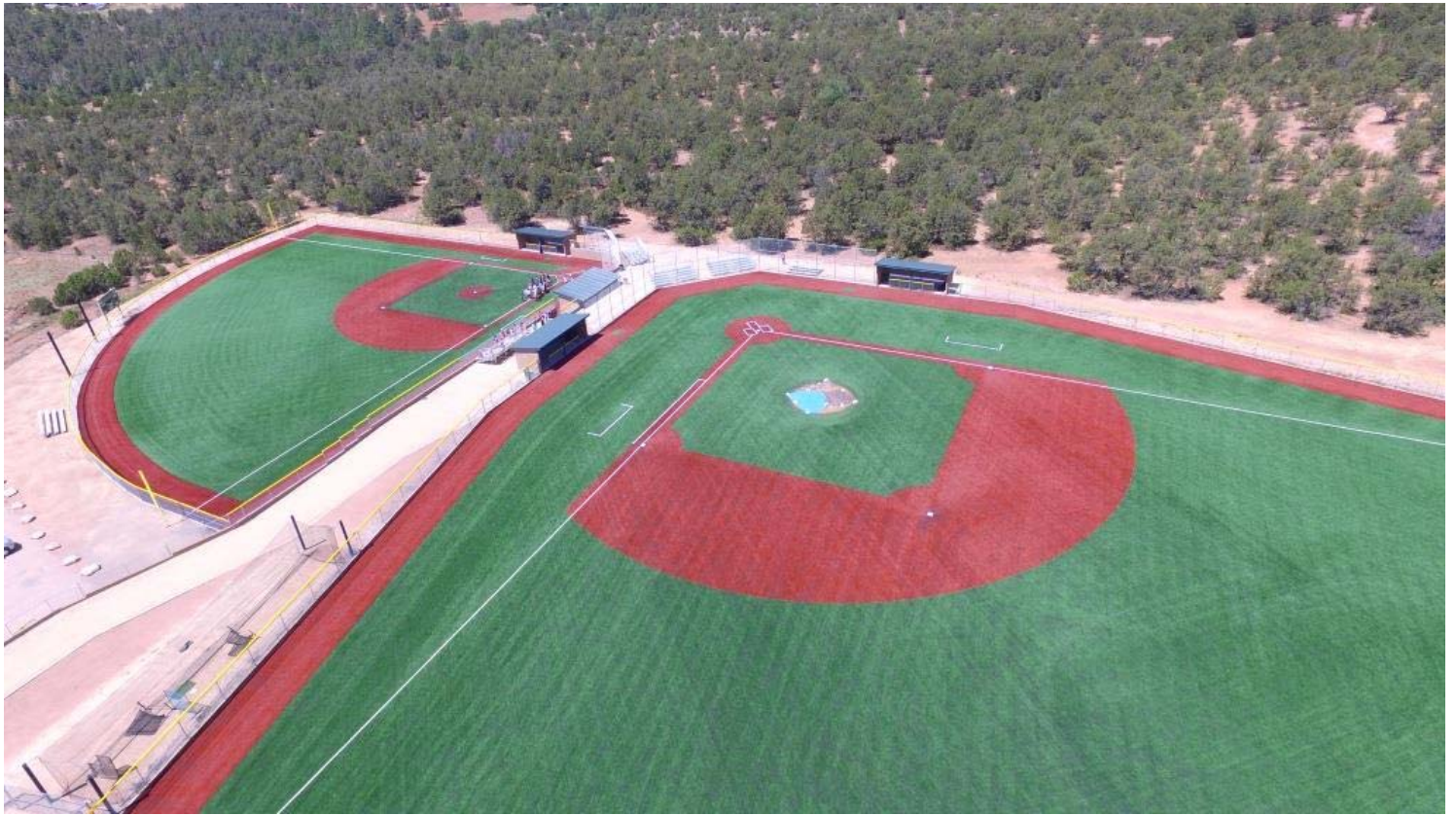
This picture of the Pecos High School Baseball and Softball Complex shows a birds eye view. Luna Community College and Pecos High School are currently talking about having a Rough Rider softball and baseball game at Pecos High.