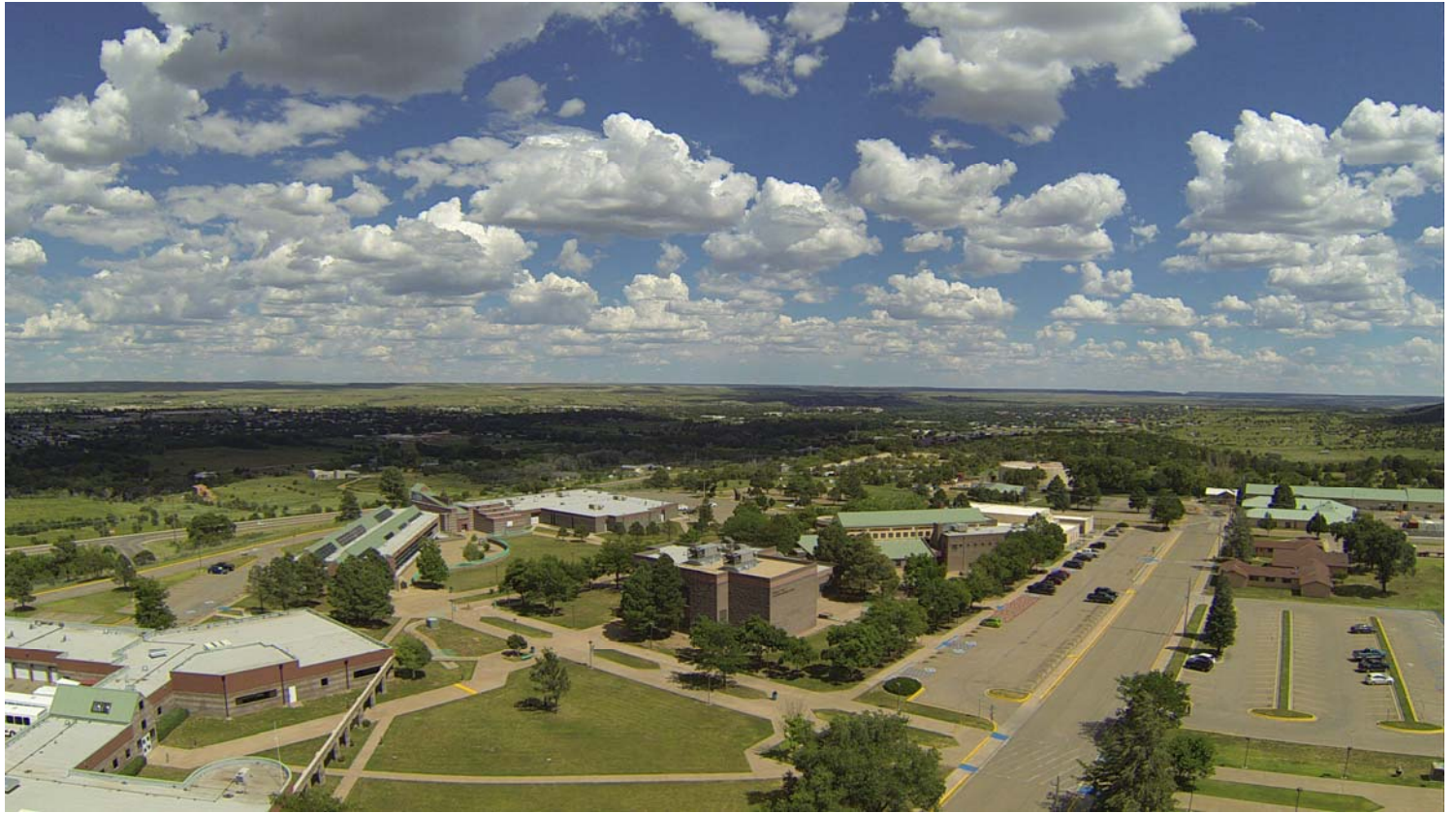
This aerial view shows Luna Community College's east side of the campus. Luna Community College stands on a hill that overlooks Las Vegas.