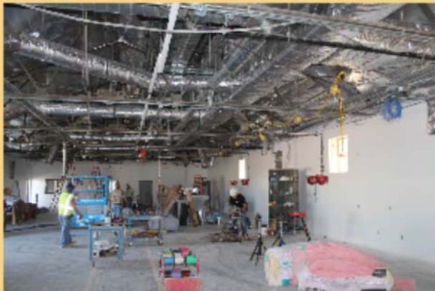
Building Trades project is coming together in Phase 1 of the initiative. Cross Connection Contractors are following the timeline before FA2015 semester starts.

Students in the class are taught residential blueprint reading, application of the National Electrical Code (NEC), New Mexico Electrical Code (NMEC) and