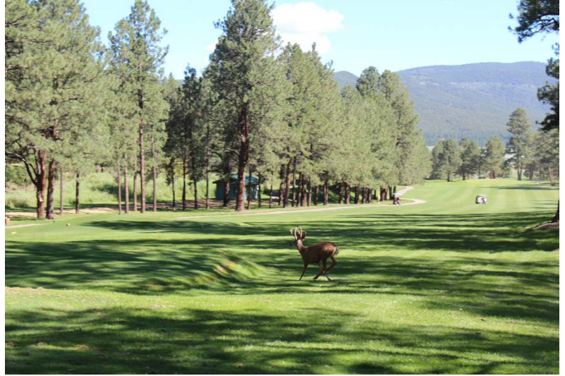
This photo was taken at last year's Luna Community College Foundation Golf Tournament at the Pendaries Golf Course in Rociada.

The Pendaries Golf Course is located about 30 minutes north of Las Vegas and is known for its stunning views of the Sangre de Cristo Mountains.